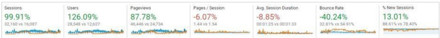
Comparison of site statistics after one year of Strategic Consulting

At the one-year mark with Strategic Consulting, Mike saw a 99.9 percent increase in total site traffic and a 40 percent decrease in bounce rate: