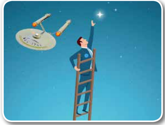
After consulting with some of my very best friends and trusted colleagues, I feel that I've discovered what was and is wrong with my own thinking, and my entire view changed.

Many of you who know me well have noticed a change over the last few years and not necessarily a good one. The more successful Foster Web Marketing became, the more insanely miserable I felt inside.