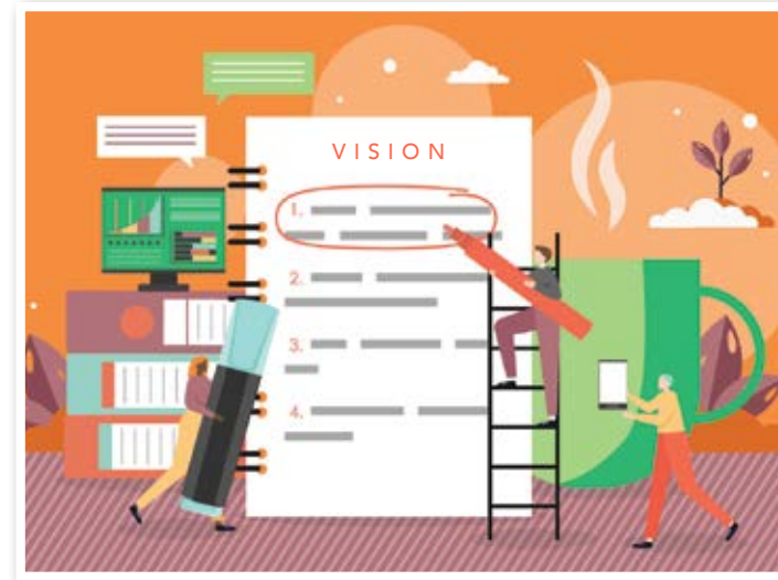
By operating with the same vision, processes, and traction, we know what to expect and can adapt and respond effectively.

Your vision needs to be 100% crystal clear, and every one of your employees needs to know and trust the vision. This will create a team with laser-sharp focus, and if there is ever a question about which direction to move, any employee should be able to refer to your vision and determine the right path. There is a formula for creating this vision, and I'll tell you how to get a copy of