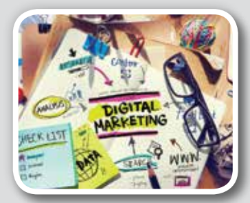
Vanity URLs should be used when running a specific campaign.

You can purchase a vanity URL from any number of domain-hosting websites, but we definitely recommend GoDaddy