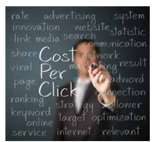
Express is especially effective for businesses that aren't trying to win out against the big dogs with highly competitive keywords.

from your Google My Business account. If your Google My Business categories don't accurately describe the types of cases you want then you need to update those first. Also, many law firms want to focus on specific types of cases that don't have a category in Google My Business. The final big downside is that you can only assign up to 10 negative keywords (keywords you don't want your ad to show up for), which you have to contact the Google Help desk to add.