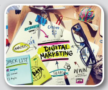
Vanity URLs should be used when running a specific campaign.

You can purchase a vanity URL from any number of domain-hosting websites, but we definitely recommend GoDaddv for ease of use when it comes